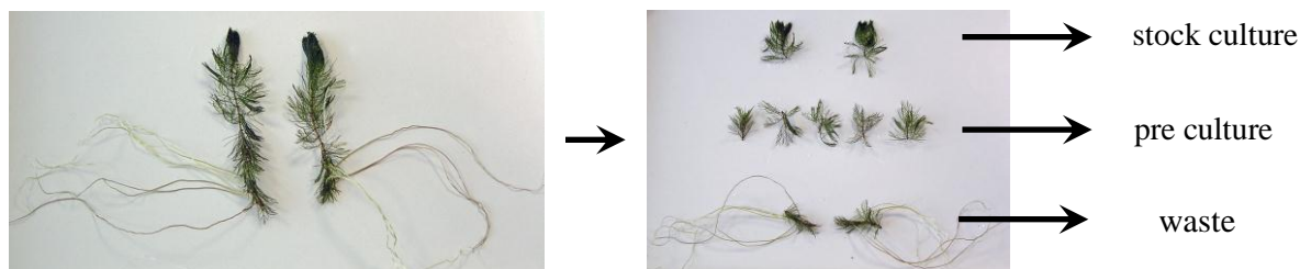
Figure 1: Cutting of plants for the stock and pre culture after 3 weeks of cultivation.

Apices as well as segments of the stem middle part for this renewed culture can be used. Number and size of transferred plants (or segments of plants) are dependent on how many plants are needed. For example, you can transfer five shoot segments into one Fernbach flask and three shoot segments into one Erlenmeyer flask, each with a length of 5 cm. Discard any rooted, flowering, dead or otherwise conspicuous parts.