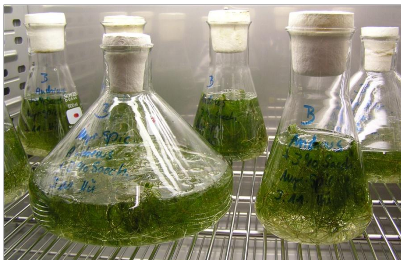
Figure 2: Culturing of plants in a cooling incubator with chamber illumination.

Culturing of plants is to be performed in 500 ml Erlenmeyer and 2000 ml Fernbach flasks in a cooling incubator at 20 \pm 2 \text{ }^\circ\text{C} with continuously light at approximately 100\text{-}150 \mu\text{E m}^{-2} \text{s}^{-1} or 6000-9000 Lux (emitted by chamber illumination with colour temperature "warm white light").